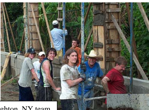
Houghton, NY team helping pour concrete

Thank you for supporting our ministry in Nicaragua. 100% of your financial gift given through The NEO Foundation is received and used in ministry here in Nicaragua. The NEO Foundation 22301 S.W. 110 th Pl. Tualatin, OR 97062