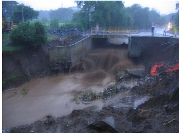
Storm water run-off that washed out the road to our home

It started to rain around 11:00 p.m. but it never amounted to anything. We've had far worse rainfalls numerous times throughout this past rainy season as you can see in the picture. In fact, we've had so much rain and it has come down so hard that we've had a hard time getting the grass on the soccer field planted. We want to get it seeded while there is still enough moisture to get it established and before the hot temperatures and drying winds of the dry season settle in. Right now it's hard to believe things will ever dry out. As we look across the soccer field it looks like we live on the waterfront of Lake Chiquilistagua.